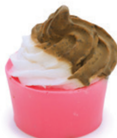
Happily Ever After