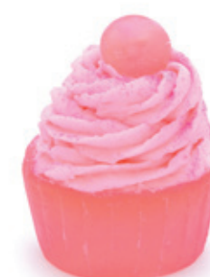
Cherry On Top