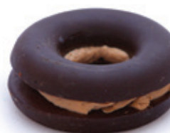
Doughnut Junkie Cocoa Cream