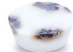
Milk & More