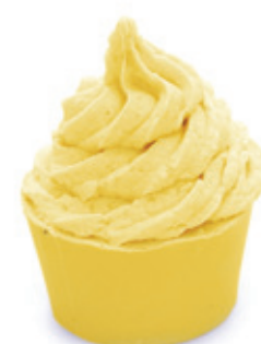
Milk and Honey