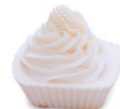
Pearl With No Shell