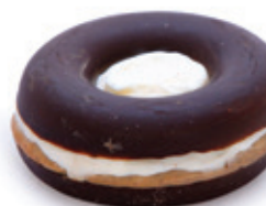
Doughnut Junkie Vanilla Cream