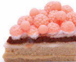
More & More